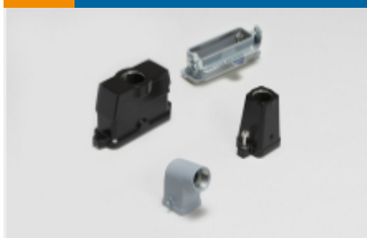
Rectangular Connector Hoods & Bases (1258)